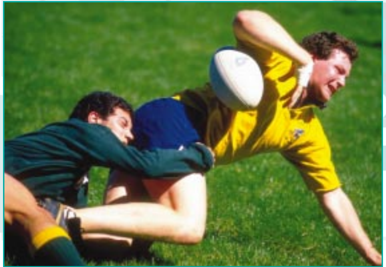
Fractures, sprains, and cartilage injuries can end a season and cause pain or disability for life.