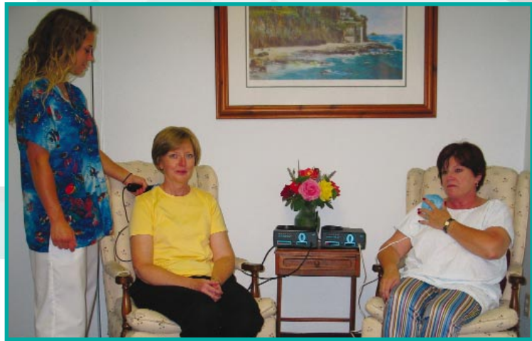
2 patients of Dr. Steinhouser are being treated in the Calming Zone.